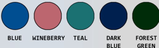
Value Line Mesh - TEXTILENE®